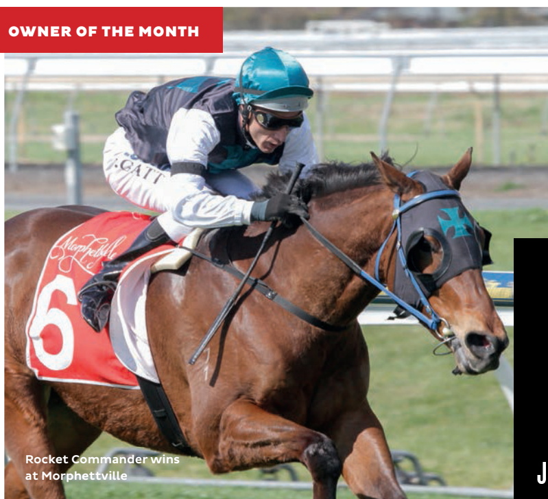
Rocket Commander wins at Morphettville